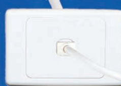
KLE02 Balun transformer cable