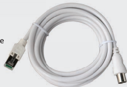
KLE02 Balun transformer cable